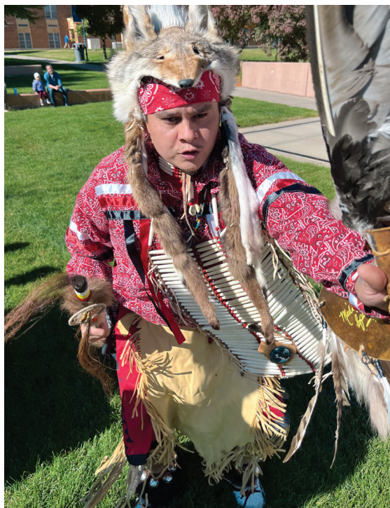
Lakota dancers perform in celebration of Indigenous Americans Day in October.

In cooperation with the DWU Diversity Council, the McGovern Center helped fund Lakota dancers on the day after Indigenous Americans Day. The weather was lovely, and the dancers were very entertaining.